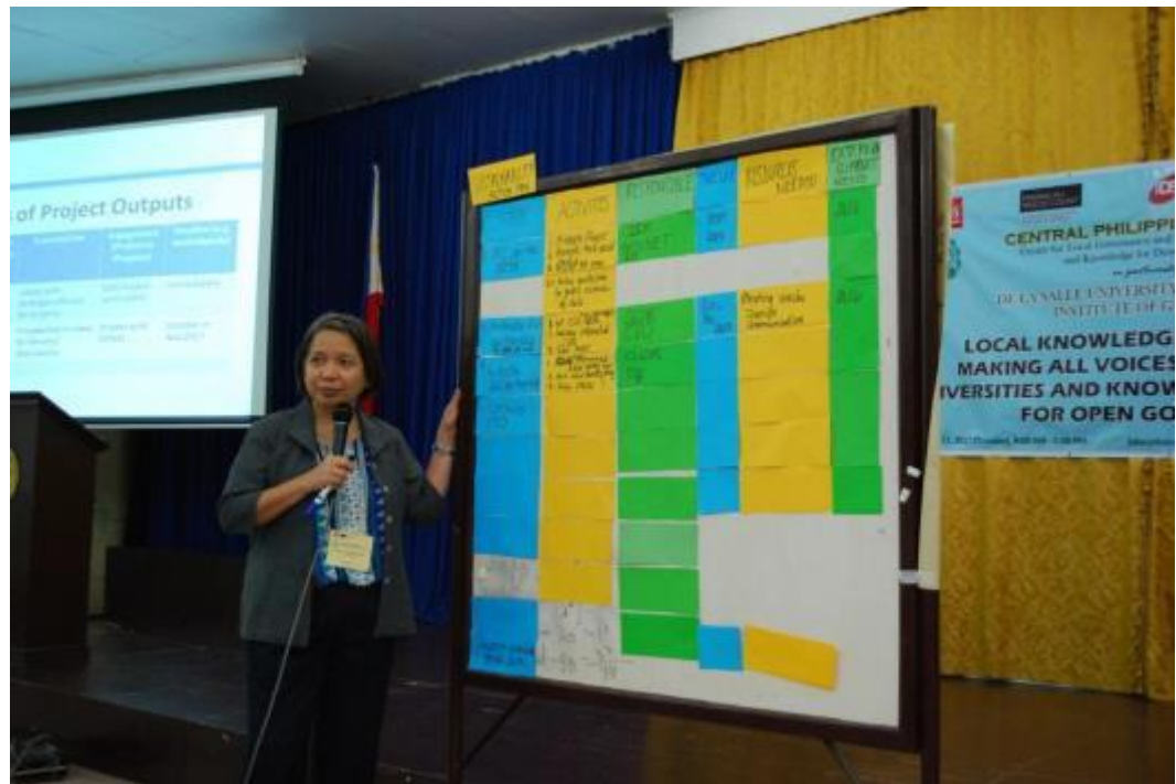
Image 2: In the local knowledge workshop in Iloilo facilitated by the Center for Local Governance and Indigenous People's Studies of Central Philippine University, local CSOs and universities used adaptive learning on how to track the next steps to continue collaborative work on open government particularly on using the budget infographics 13 . As a result of the project, local CSOs in Iloilo and the CLGIPs will sign a memorandum of agreement on open government initiatives.

government agencies and regional CSO networks to discuss specific local policy issues on open government and social accountability tools 12 .