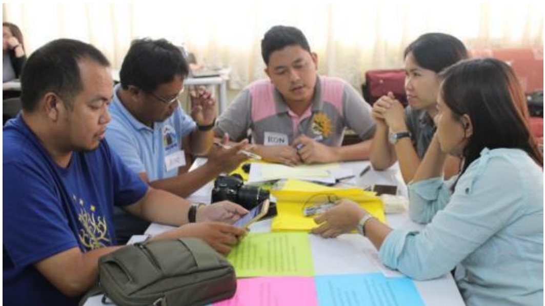
Image 1: Local CSO Networks in Naga City and Bicol discuss how they will use the city budget infographics developed by the Center for Local Governance of Ateneo de Naga University.

the development of new local knowledge partnerships between regional universities, civil society organizations and local government units. For example, the newly established City Poverty Reduction Action Team and Local CSO Office of Cagayan de Oro City will partner with Xavier University to utilize the knowledge portal developed by GLI 9 . In Iloilo, CLGIPS will sign a memorandum of agreement with a regional CSO network to help the latter in analyzing the city and provincial government budget on disaster risk reduction and management. The City Government of Iloilo City has also expressed an interest in working with CLGIPS on producing infographics to guide the city's traffic management policies. Moreover, the CLG is partnering with a regional CSO network to work on capacity development activities for local CSOs in poor municipalities.