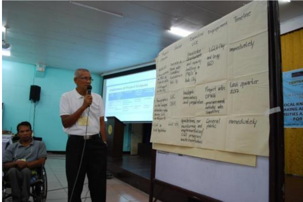
Image 5: Local CSOs in Iloilo used adaptive learning to plan for activities in the partnership with CLGIPS.